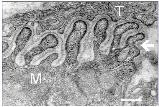
Electron micrograph showing a crosssection through the neuromuscular junction. T is the axon terminal. M is the muscle.

In the 1950s, scientists discovered that injecting tiny amounts of purified BoNT into the neuromuscular junction causes the muscle to not be able to move. That is, it paralyzes the muscle. In the 1970s, a scientist experimented with BoNT type-A (see a later section for more information on the different types of BoNT) in animals and, in 1980, used a form of BoNT type-A for the first time to treat crossed eyes (strabismus) in a person. After scientists completed more research, the US Food and Drug Administration (FDA) approved the use of one form of BoNT type-A, originally called Oculinum (this same substance is now called onabotulinumtoxinA or Botox) for the treatment of strabismus and blepharospasm in 1989. The FDA also approved the use of onabotulinumtoxinA for the treatment of cervical dystonia in 2000, and for the treatment of spasticity in the flexor muscles of the elbow, wrist, and fingers in 2010.